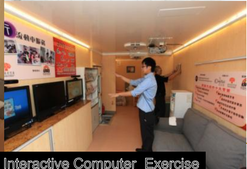
Interactive Computer Exercise